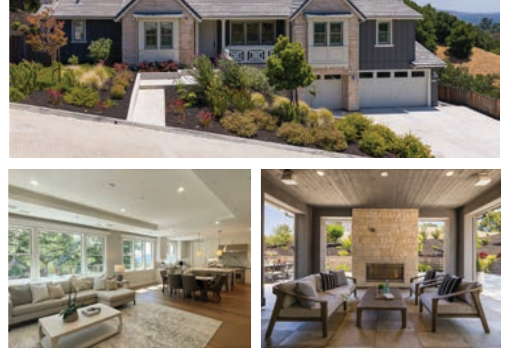
216 Seclusion Valley Way, Lafayette 5 BD | 4.5 BA | 3,674 SF | Built in 2018

Wednesday, July 24, 7 p.m. Teleconference Meeting via Love Lafayette YouTube http://bit.ly/LoveLafayetteYouTube